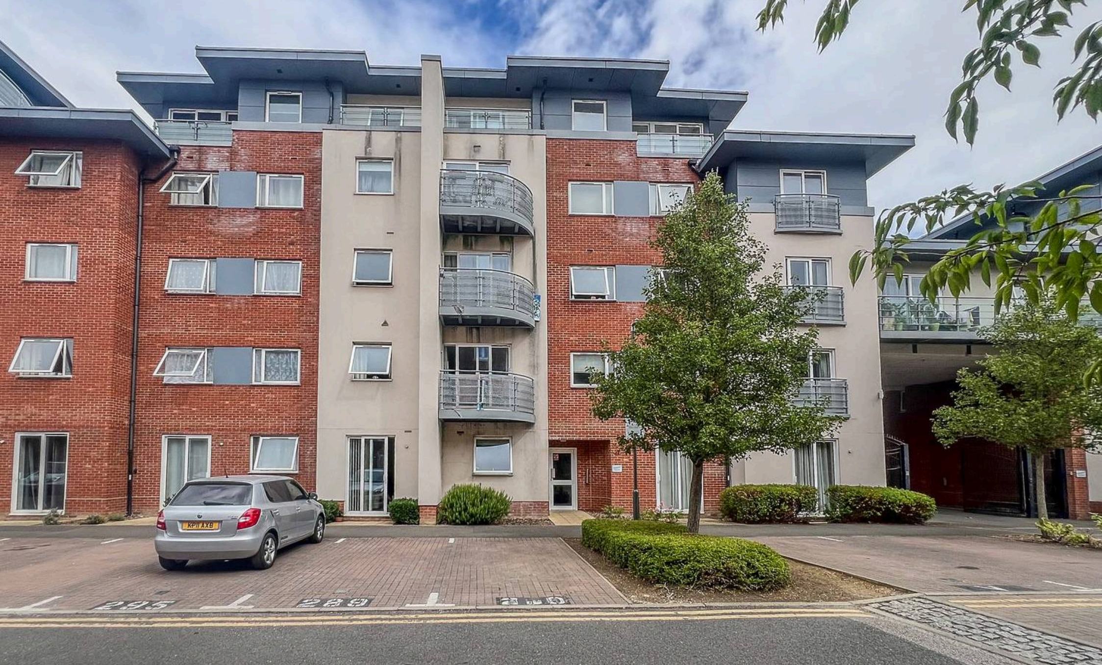
Flat 36, Stanton House Aylesbury